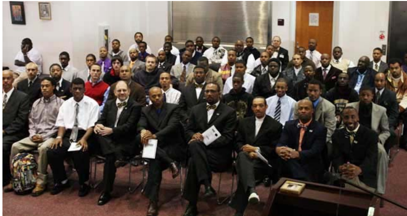
On Nov. 17, the Preparing Men for Intellectual, Academic & Educational Success (PRIDE) of Halifax Male Mentoring Program hosted the second annual PRIDE of Halifax Induction Ceremony at the Centre. Pictured are inductees along with program personnel and mentors.