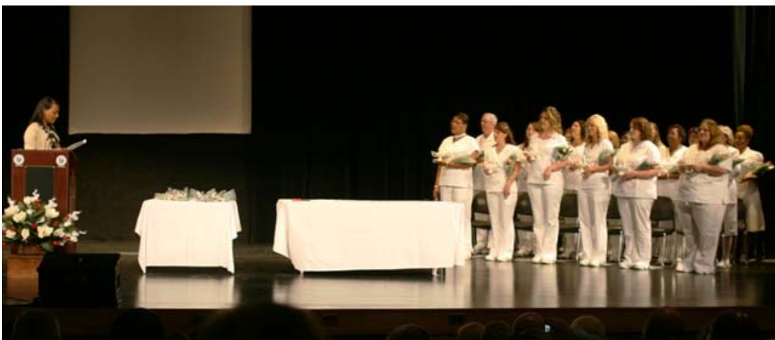
Nursing graduates taking the Nursing Pledge of 2011 during the ceremony

Halifax Community College held an Associate Degree Dental Hygiene and Associate Degree Nursing Graduates Pinning Ceremony for the class of 2011, May 12.