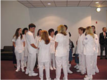
Allied Health Students